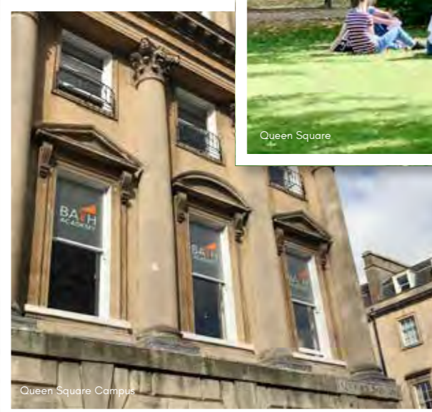
Queen Square Campus