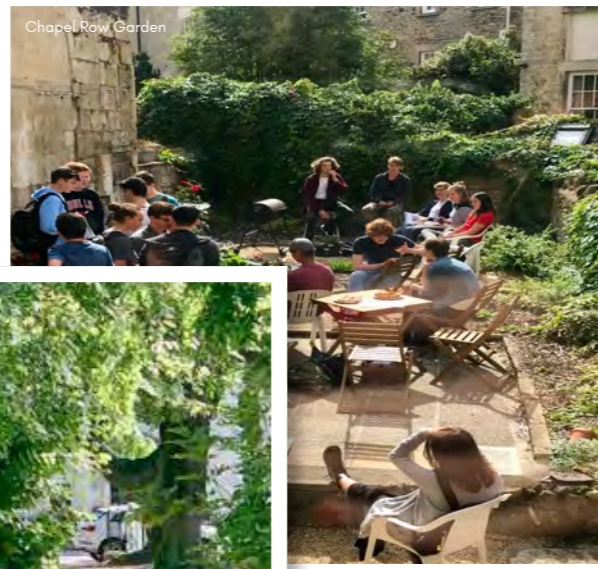
Chapel Row Garden