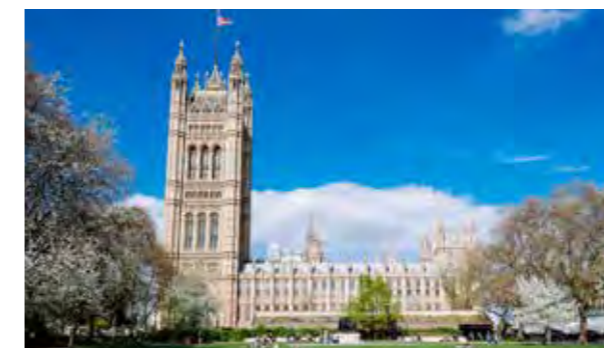
You can also study the UFP at David Game College in London, close to iconic buildings such as the Tower of London, the Gherkin, the Bank of England and the Shard.

*All international students are required to take English Language tuition as part of the course programme, either to prepare them for the IELTS examination or, to ensure that all UFP students meet university English Language entry requirements. Students who are mother-tongue English speakers or have an IELTS score of at least 6.5 study Communication Skills instead of IELTS to help them prepare for the demands of university academics.