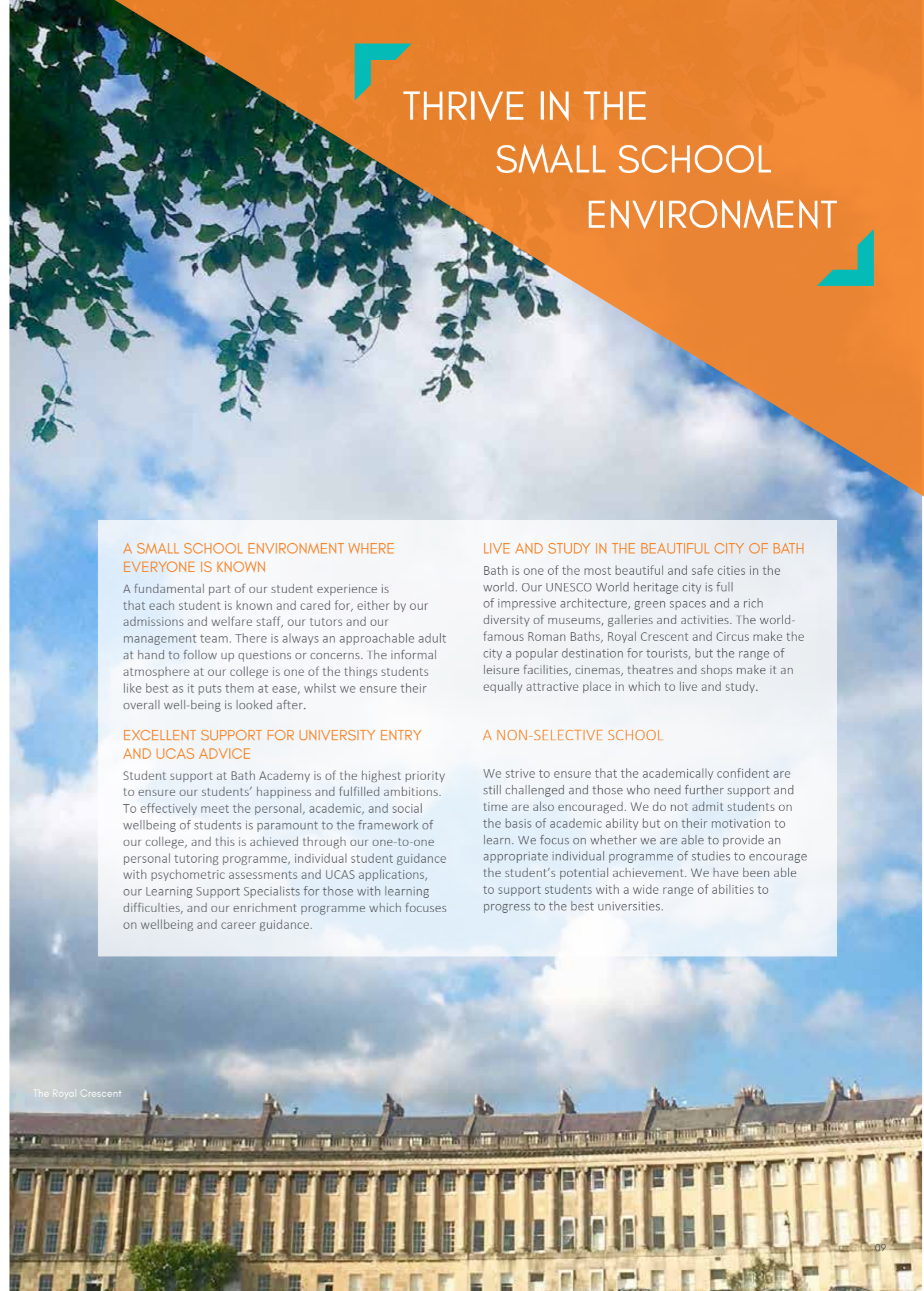
The Royal Crescent

We strive to ensure that the academically confident are still challenged and those who need further support and time are also encouraged. We do not admit students on the basis of academic ability but on their motivation to learn. We focus on whether we are able to provide an appropriate individual programme of studies to encourage the student's potential achievement. We have been able to support students with a wide range of abilities to progress to the best universities.