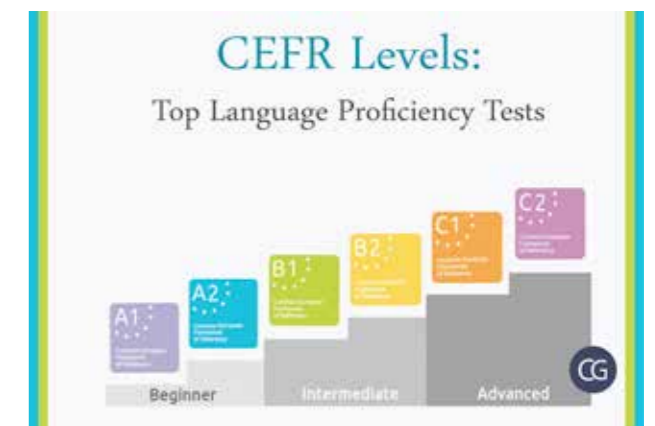
CEFR stands for Common European Framework of Reference. The CEFR levels provide a way of describing a person's language proficiency.

Your class level can change any week when you and your teacher agree you are ready. As a guide, it takes approximately 200 learning hours to progress from one level to the next.