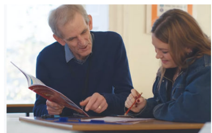
Welcome to Bath Academy