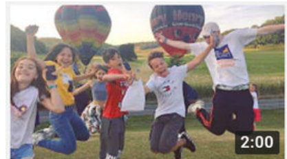
Junior Summer School Returns!