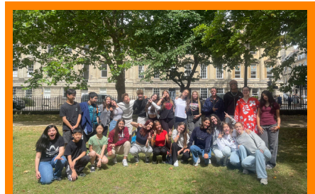
Junior Summer School